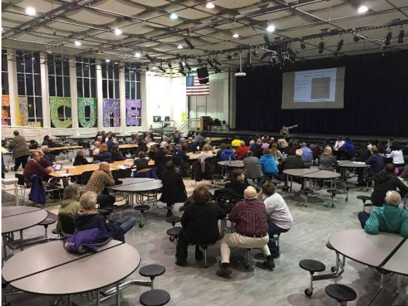
Ramsey County Public Meeting on Rice Street Study