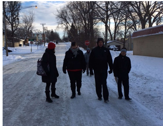
Hoyt Ave on Project Team's Area Walk